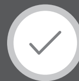
After Eligible Expense