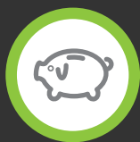
Pre-Tax Payment/ Contribution