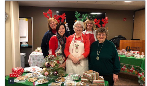
Holiday Bake & Craft Sale