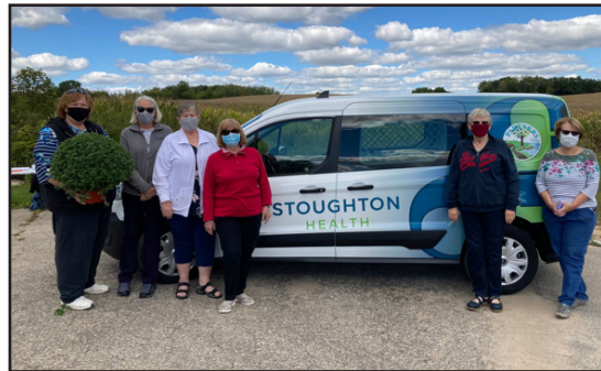
Stoughton Health Van