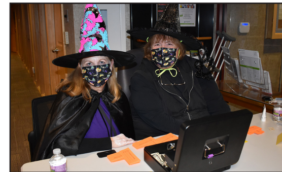
Pumpkins on Parade