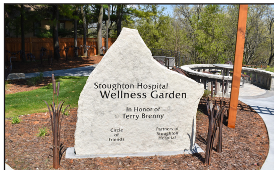
Stoughton Hospital Wellness Garden