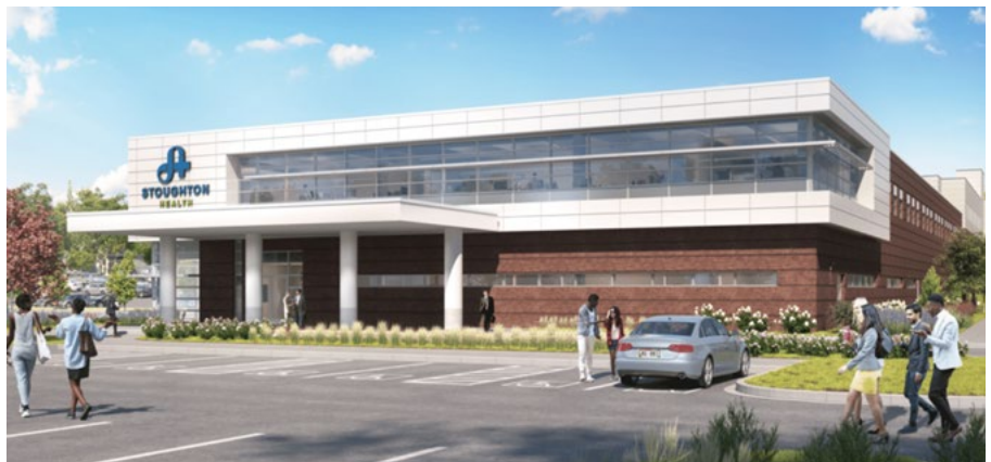
Medical Outpatient Building coming spring 2025.

To accommodate future growth, the ground level of this new facility will include 24,000 square feet of “shell space”. In addition, the building has been designed so another floor could easily be added, should more space be required. Preparing for future growth now is the most cost-effective way to ensure Stoughton Health will be able to continue achieving our mission to provide safe, quality healthcare with exceptional personalized service.