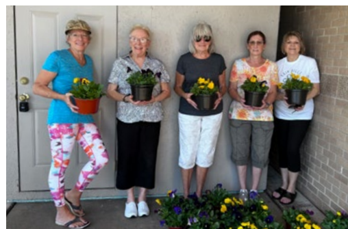
Partners of Stoughton Hospital Pansy Sale.

Watch this fall for information on the Partners annual mum sale!